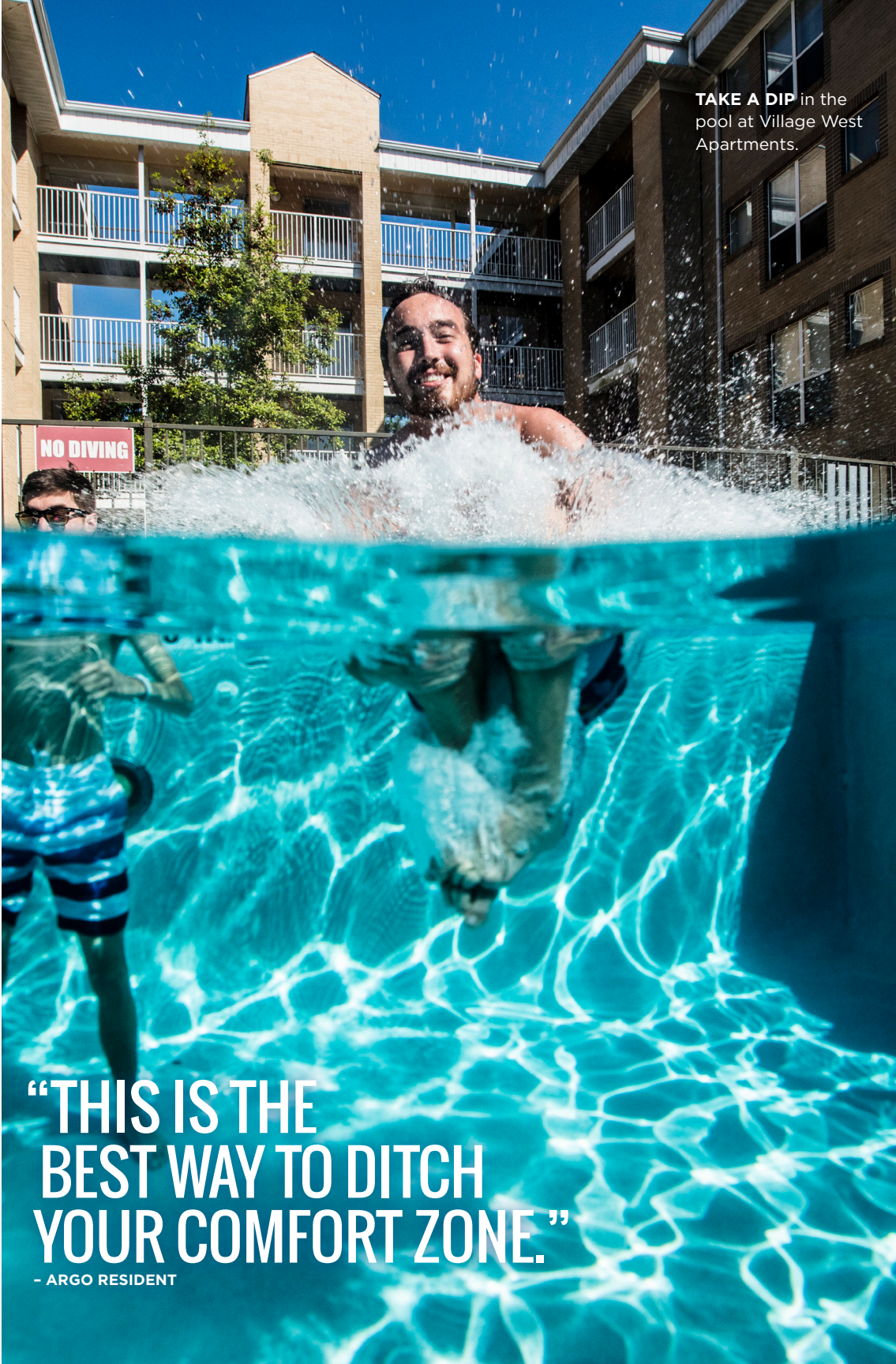
TAKE A DIP in the pool at Village West Apartments.

PING PONG. POOL TABLES. PIZZA. Grab a slice from Papa John's in Presidents Hall. Then hang out in one of our game rooms or TV lounges.